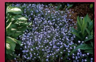
Forget Me Not