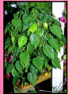
Sweet Heart Plant