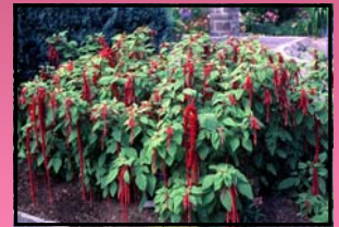
Love Lies Bleeding